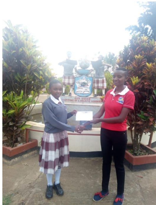
DLSF Presents a Shopping Voucher to a Winner of an Online Campaign