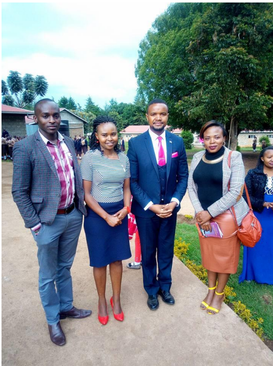
DLSF Friends during Dear Little Sister Book Launch