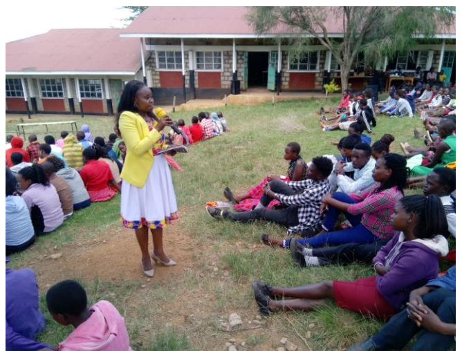
A DLSF Sensitization Forum at Kapkondor Secondary Grounds