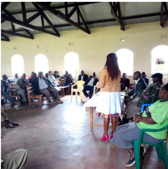
DLSF Director addressing Chepseon Location Community Leaders