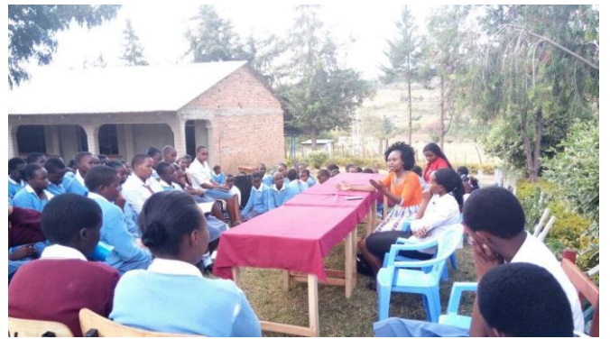
A Training Session at Tugunon Secondary School