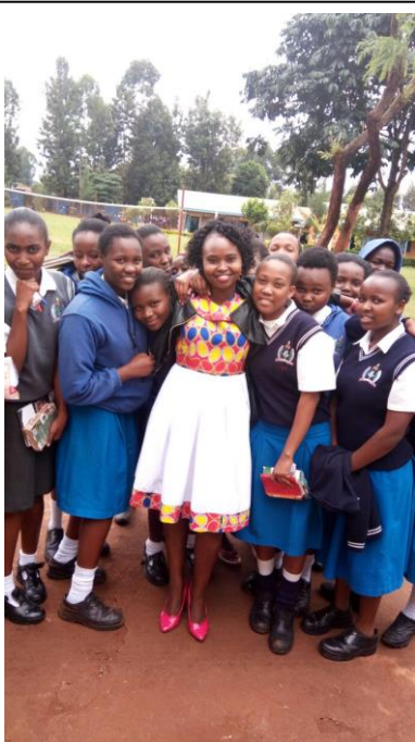
DLSF Founder with Thumaita High School Students