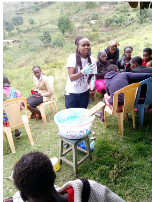
DLSF Trains Teenage Mothers on Soap Making