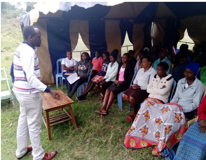
DLSF Trainer Addressing Teenage Mothers at Tembwet Village Grounds