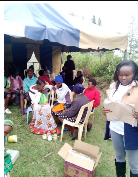
DLSF Trainer Addressing Teenage Mothers at Tembwet Village Grounds