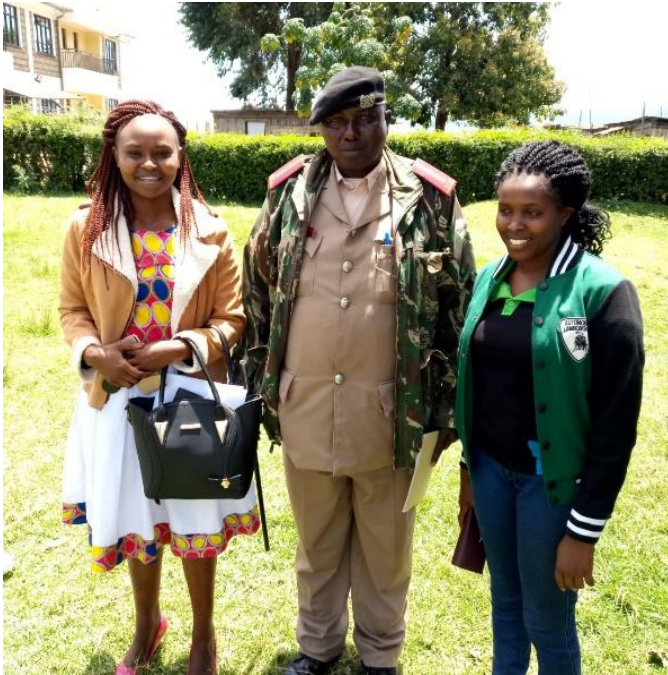
DLSF Officials with Chepseon Location Chief