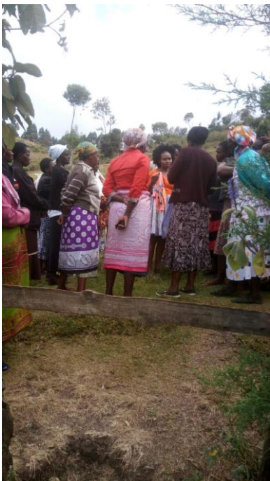
DLSF Founder Addressing Chepseon Community Women Leaders