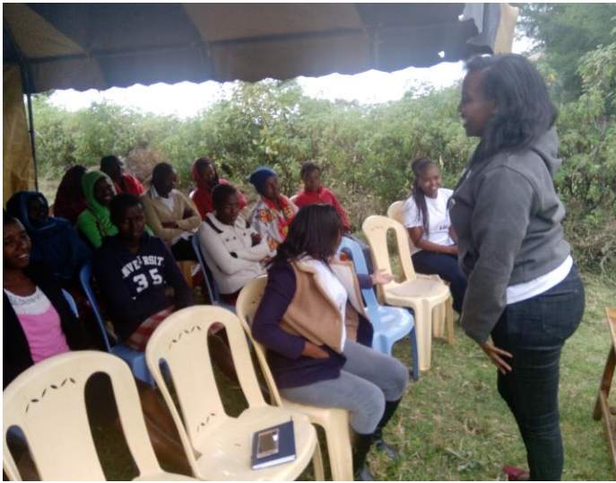
DLSF Trainer Addressing Teenage Mothers at Tembwet Village Grounds