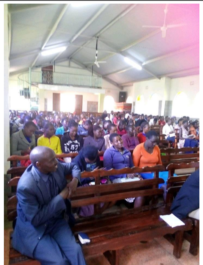
DLSF Training Girls at Chepseon AIC Church