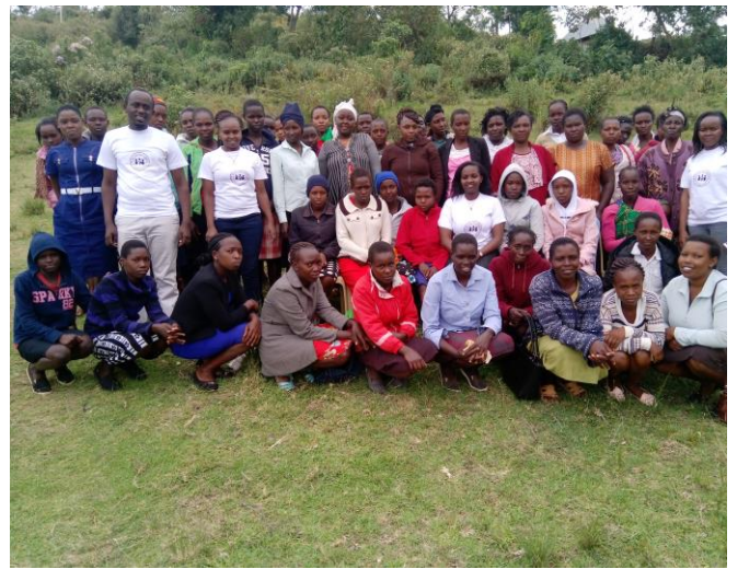
DLSF Officials with Teenage Mothers at Tembwet Village Grounds