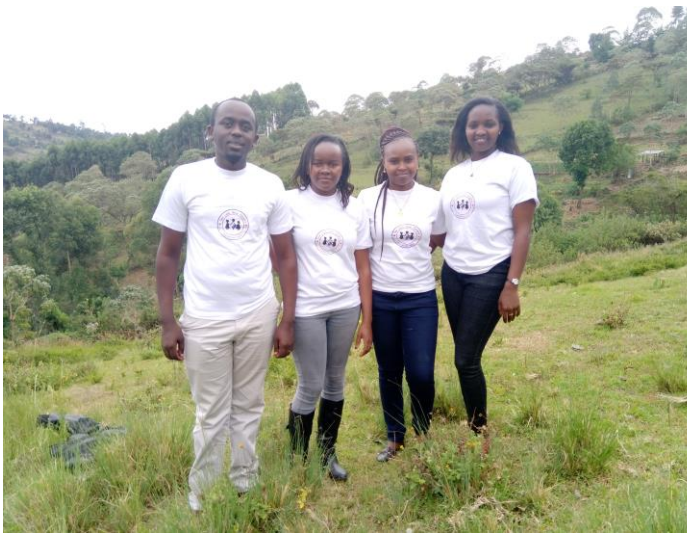
DLSF Trainers after a Training Session at Tembwet – Kericho County