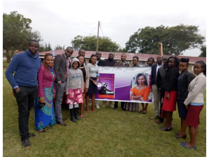
DLSF Friends during Dear Little Sister Book Launch