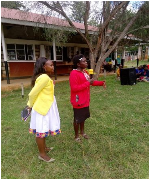
A Teenage Girl Sharing Her Views during a Training