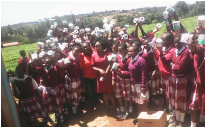
DLSF Donating Toiletries to Girls at Kio Secondary School