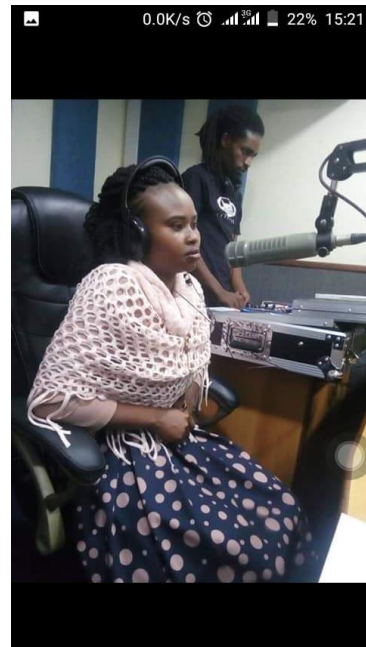
DLSF Founder in a Talk Show at Emoo Fm